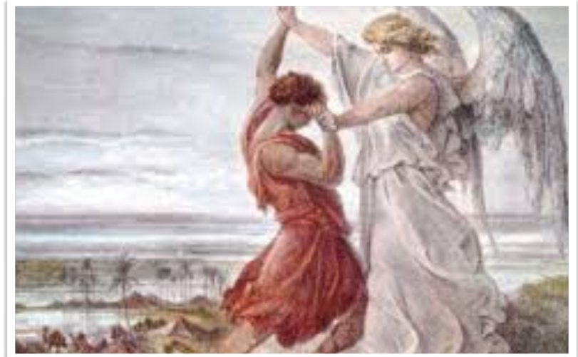
Jacob struggles with the Angel of the Lord. A lesson in Worship!

Struggle with Jesus when you are persecuted and reviled by neighbors who trust the promises of the World, Satan, Business and Religion. Love.