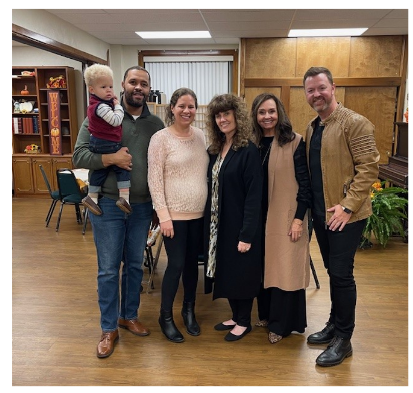
Sacred Harmony—last Sunday night (the 12th) - what an amazing group!!

Heritage Hall Nov 15: cancelled United Methodist Men: 8 Pop'N for Jesus: 5