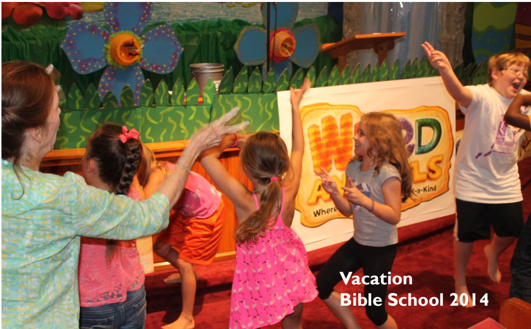
Vacation Bible School 2014