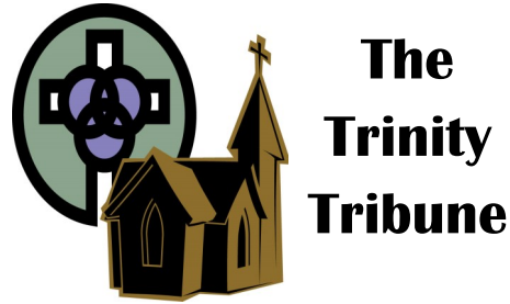
A Publication of Trinity United Methodist Church Volume 7 No. 25, Sunday June 24, 2018