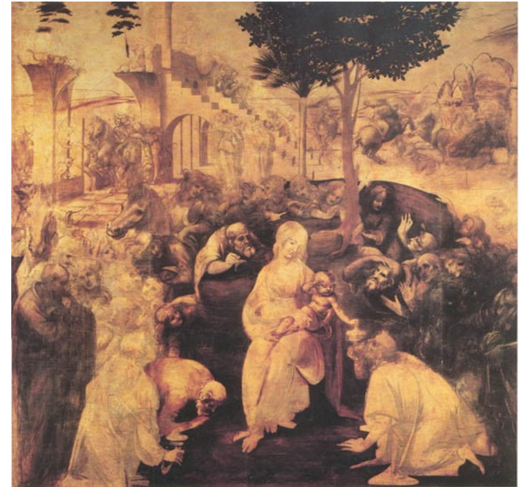
The Adoration of the Magi by Leonardo Da Vinci