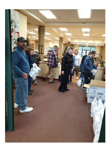
Pics from MEOC Pace Center—Trinity, SON Ministry and other individuals from the community put food packages together for the Elderly at the Pace Center to take home over the holidays!