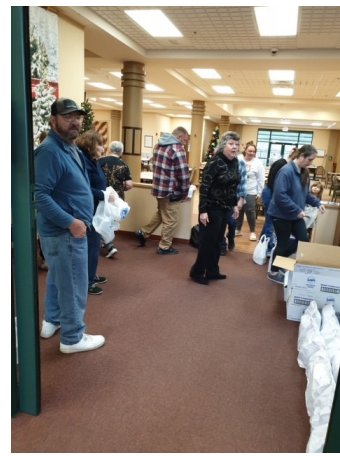
Pics from MEOC Pace Center—Trinity, SON Ministry and other individuals from the community put food packages together for the Elderly at the Pace Center to take home over the holidays!