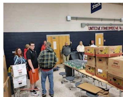
Backpack Christmas Project