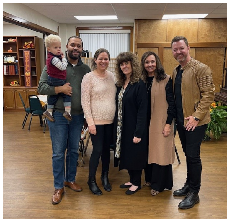
Sacred Harmony —last Sunday night (the 12th) - what an amazing group!!

Sunday School: 5 In-Person Worship: 33 Facebook Live: 13 Visitors: 2 Heritage Hall Nov 15: cancelled United Methodist Men: 8 Pop’N for Jesus: 5